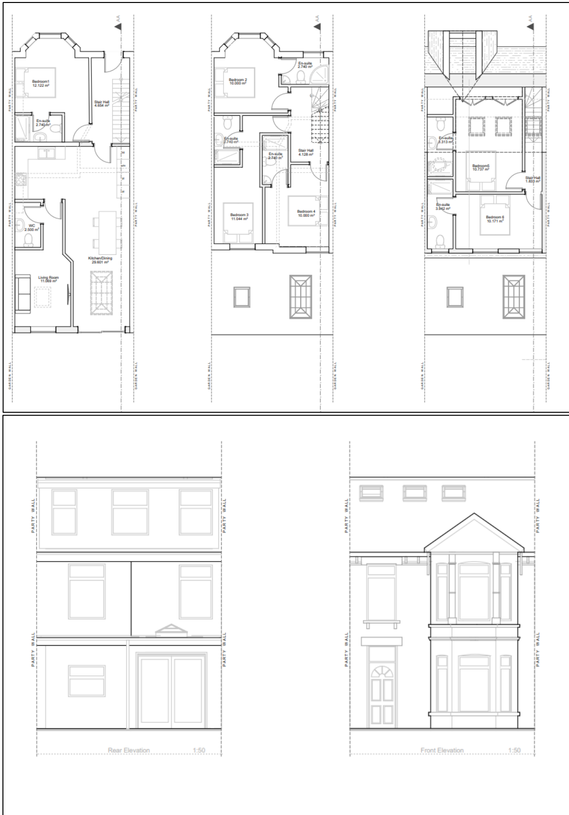
Figures 2 and 3 - Proposed Elevations and Plans