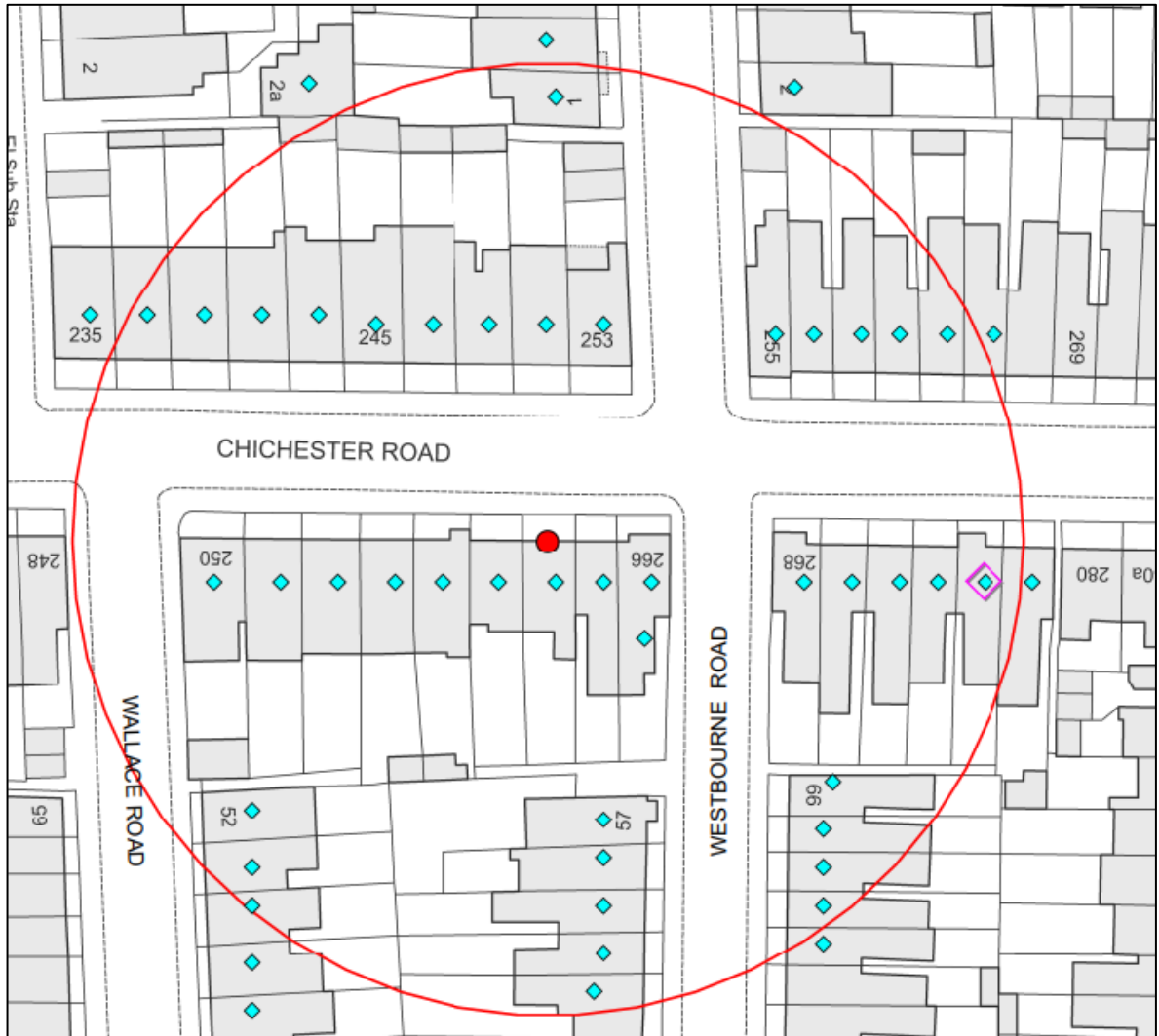
Figure 3 - Existing HMOs within 50m of the application site